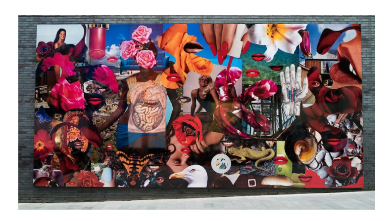
'Bower of Bliss' by Linder (2021)