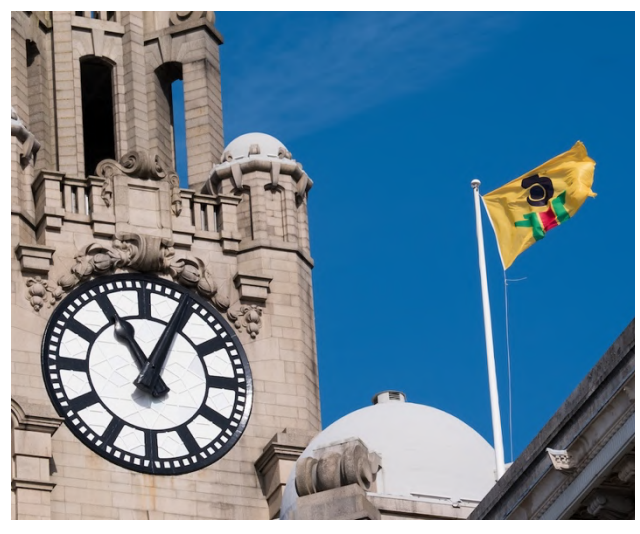
'Pan African Flag for the Relic Travellers' Alliance' by Larry Achiampong (2017 ongoing)