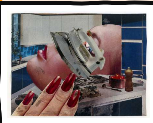
Linder, Untitled (1977)

How many different objects can you find in this collage?